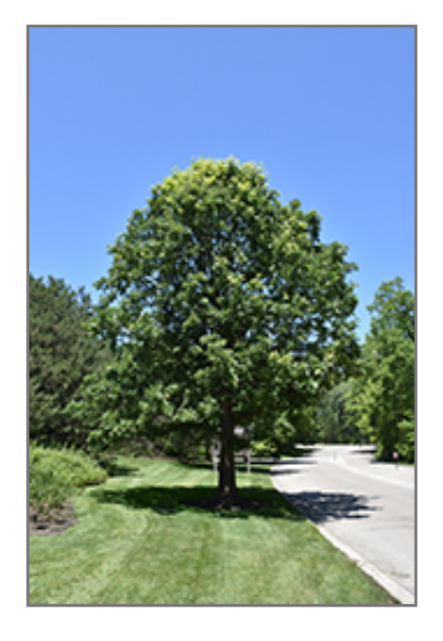
Bur Oak