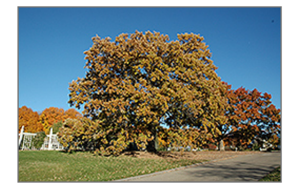
Bur Oak in fall