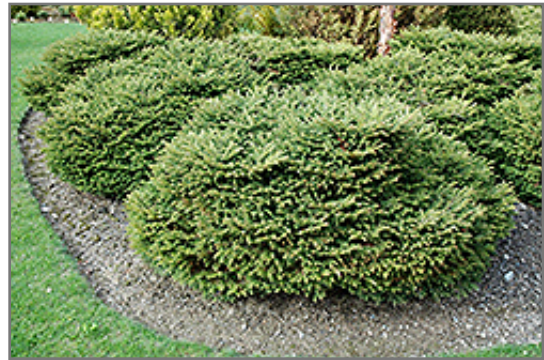
Creeping Norway Spruce