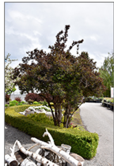
Black Beauty Elder