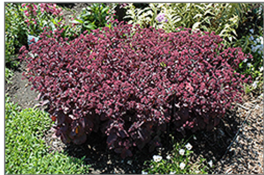
Xenox Stonecrop in bloom