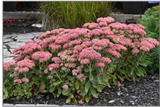
Autumn Fire Stonecrop in bloom

Autumn Fire Stonecrop is recommended for the following landscape applications;