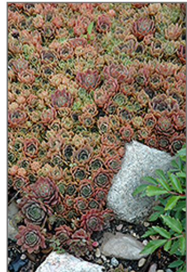
Silverine Hens And Chicks