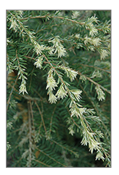
Summer Snow Hemlock foliage