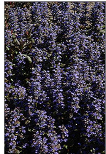
Purple Brocade Bugleweed flowers