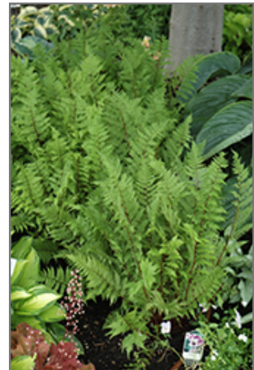
Lady in Red Fern