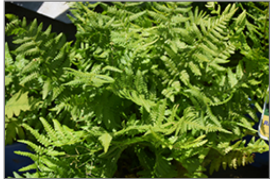
Robust Male Fern foliage

Robust Male Fern is recommended for the following landscape applications;