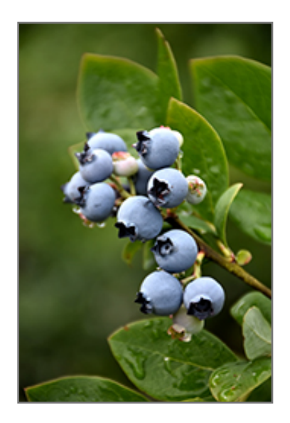
Northblue Blueberry fruit