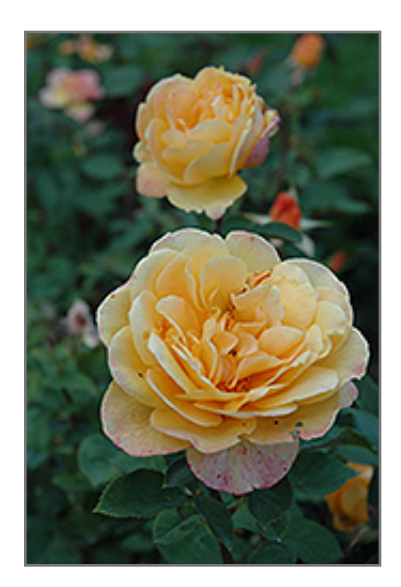
Strike It Rich Rose flowers

Columbus Garden Center - 1156 Oakland Park Avenue, Columbus, OH 43224-3317 Phone: 614-268-3511 Fax: 614-784-7700 Delaware Garden Center - 25 Kilbourne Road, Delaware, OH 43015 Phone: 740-548-6633 Fax: 740-363-2091 Dublin Garden Center - 4261 West Dublin-Granville Road, Dublin, Ohio 43017 Phone: 614-874-2400 Fax: 614-874-2420 New Albany Garden Center - 5211 Johnstown Rd, New Albany, Ohio 43054 Phone: 614-917-1020 Fax: 614-917-1023