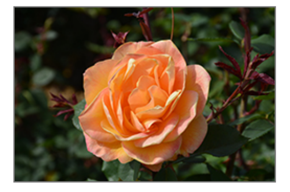
Strike It Rich Rose flowers