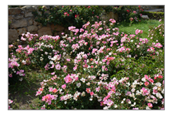
Rainbow Knock Out Rose in bloom