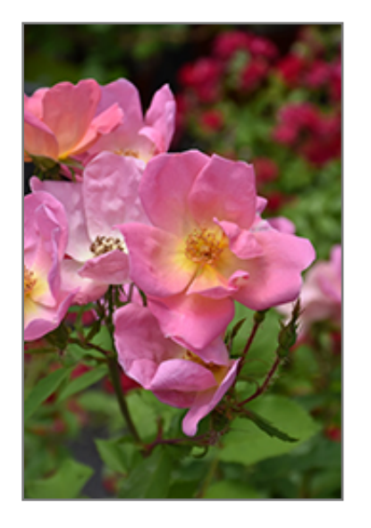
Rainbow Knock Out Rose flowers