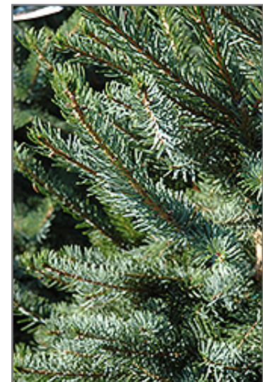
Bruns Spruce foliage