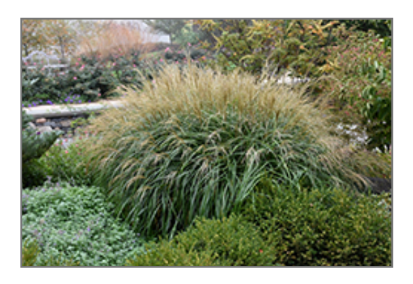
Adagio Maiden Grass flowers