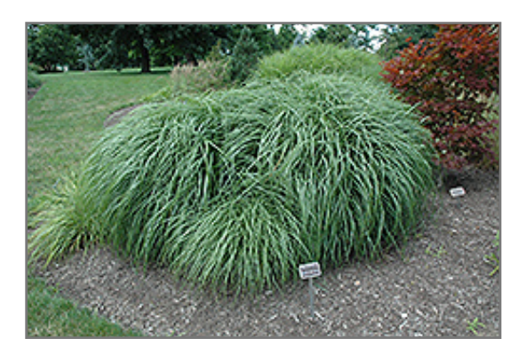
Adagio Maiden Grass foliage

Columbus Garden Center - 1156 Oakland Park Avenue, Columbus, OH 43224-3317 Phone: 614-268-3511 Fax: 614-784-7700 Delaware Garden Center - 25 Kilbourne Road, Delaware, OH 43015 Phone: 740-548-6633 Fax: 740-363-2091 Dublin Garden Center - 4261 West Dublin-Granville Road, Dublin, Ohio 43017 Phone: 614-874-2400 Fax: 614-874-2420 New Albany Garden Center - 5211 Johnstown Rd, New Albany, Ohio 43054 Phone: 614-917-1020 Fax: 614-917-1023