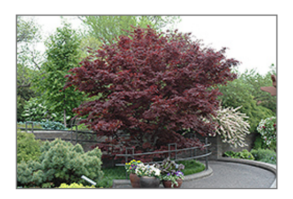
Bloodgood Japanese Maple