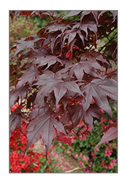
Bloodgood Japanese Maple foliage