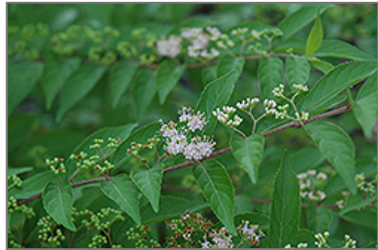
Issai Beautyberry flowers

Issai Beautyberry will grow to be about 4 feet tall at maturity, with a spread of 5 feet. It tends to fill out right to the ground and therefore doesn't necessarily require facer plants in front. It grows at a fast rate, and under ideal conditions can be expected to live for approximately 20 years.