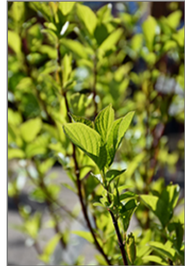
Bailey Red-Twig Dogwood foliage

This shrub does best in full sun to partial shade. It is an amazingly adaptable plant, tolerating both dry conditions and even some standing water. It is not particular as to soil type or pH. It is highly tolerant of urban pollution and will even thrive in inner city environments. This species is native to parts of North America.