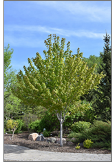
Autumn Spire Red Maple

* This is a 'special order' plant - contact store for details