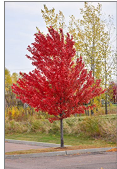
Autumn Spire Red Maple in fall