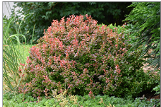
Admiration Japanese Barberry