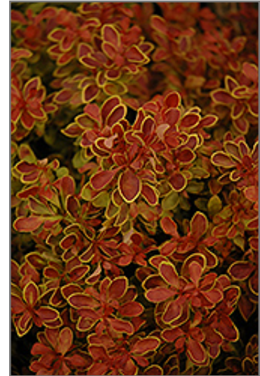
Admiration Japanese Barberry foliage

Admiration Japanese Barberry is recommended for the following landscape applications;