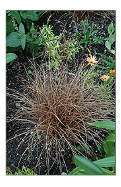
Weeping Brown Sedge