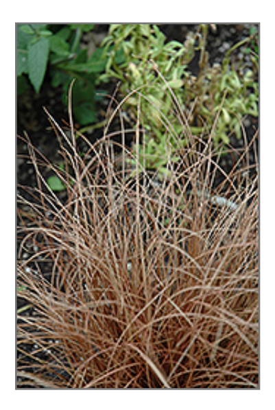
Weeping Brown Sedge foliage