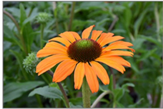
Tangerine Dream Coneflower flowers

Tangerine Dream Coneflower is recommended for the following landscape applications;