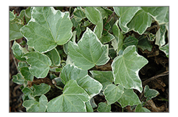
Midas Touch Ivy foliage