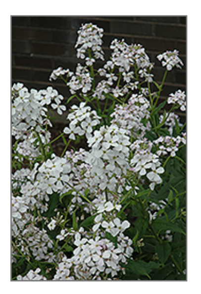
Dame's Rocket flowers