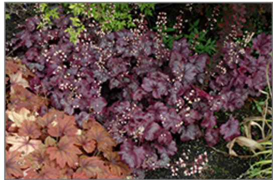
Plum Royale Coral Bells in bloom