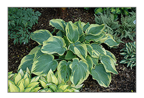
Earth Angel Hosta