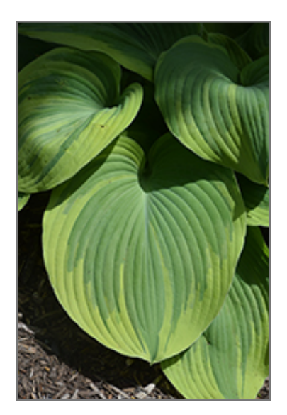
Earth Angel Hosta foliage