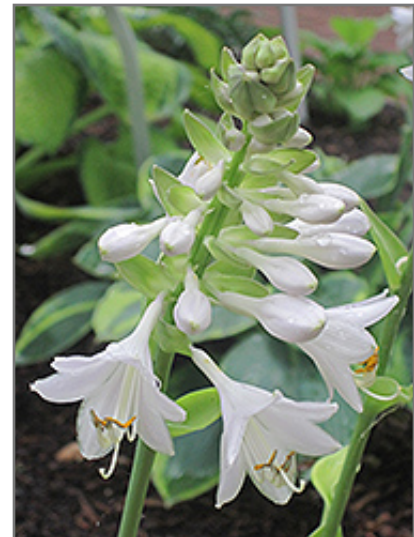
King Tut Hosta flowers