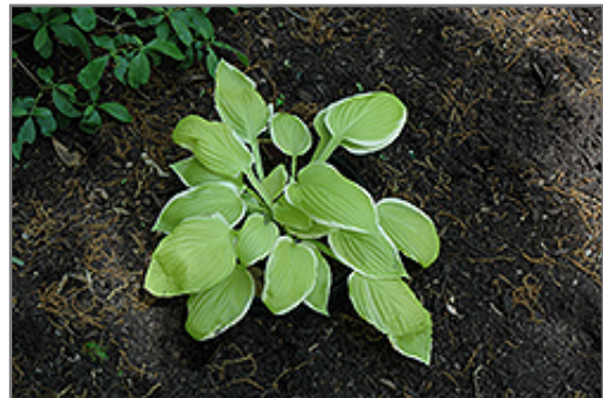
St. Elmo's Fire Hosta