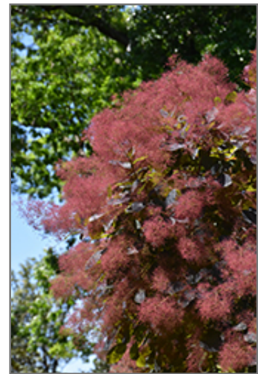
Grace Smokebush flowers