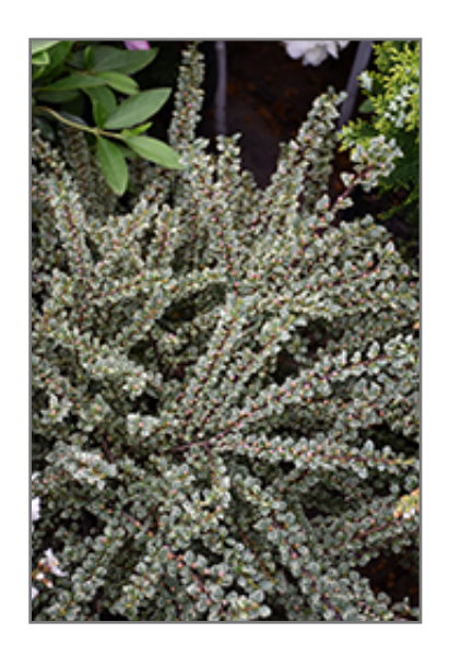
Variegated Cotoneaster foliage