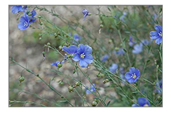
Sapphire Perennial Flax flowers