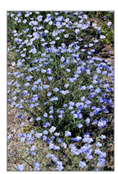
Sapphire Perennial Flax in bloom

Sapphire Perennial Flax is recommended for the following landscape applications;