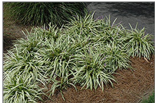
Variegata Lily Turf in bloom