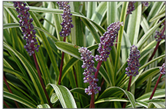
Variegata Lily Turf flowers

Variegata Lily Turf is recommended for the following landscape applications;