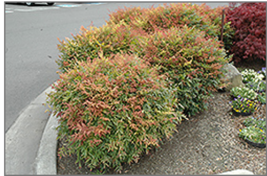
Sienna Sunrise Nandina