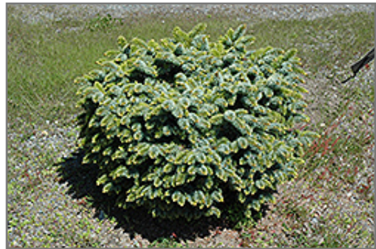
Papoose Dwarf Sitka Spruce