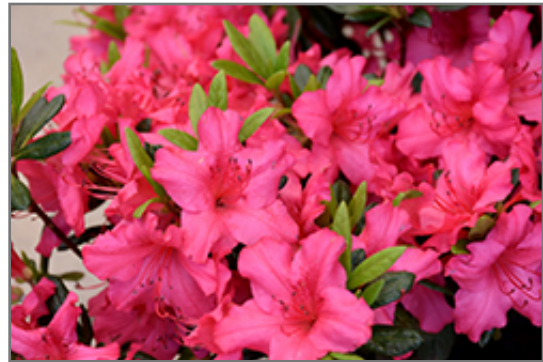
Girard's Rose Azalea flowers