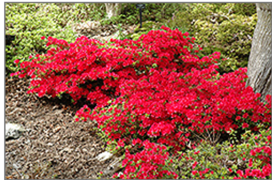
Hino Crimson Azalea in bloom