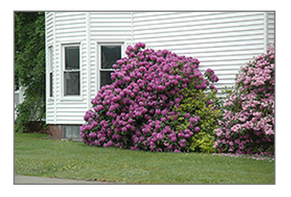
Purpureum Elegans Rhododendron in bloom