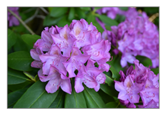
Purpureum Elegans Rhododendron flowers