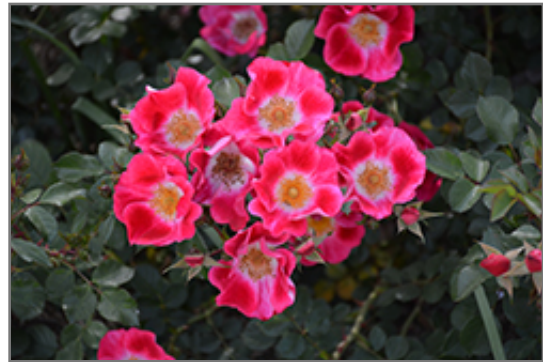
Carefree Spirit Rose flowers

Carefree Spirit Rose is recommended for the following landscape applications;