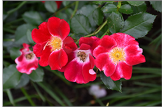
Carefree Spirit Rose flowers

Carefree Spirit Rose is recommended for the following landscape applications;