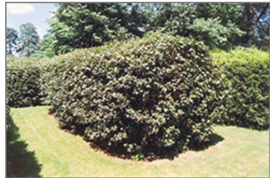
Hedge Maple