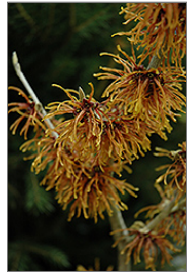
Jelena Witchhazel flowers

Jelena Witchhazel is recommended for the following landscape applications;