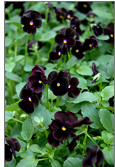
Sorbet Black Delight Pansy flowers