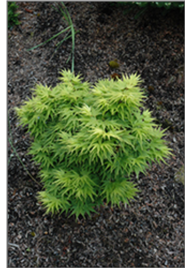
Mikawa Yatsubusa Japanese Maple

Mikawa Yatsubusa Japanese Maple is a fine choice for the yard, but it is also a good selection for planting in outdoor pots and containers. With its upright habit of growth, it is best suited for use as a 'thriller' in the 'spiller-thriller-filler' container combination; plant it near the center of the pot, surrounded by smaller plants and those that spill over the edges. It is even sizeable enough that it can be grown alone in a suitable container. Note that when grown in a container, it may not perform exactly as indicated on the tag - this is to be expected. Also note that when growing plants in outdoor containers and baskets, they may require more frequent waterings than they would in the yard or garden.