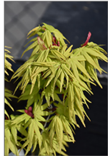
Mikawa Yatsubusa Japanese Maple foliage

Mikawa Yatsubusa Japanese Maple is recommended for the following landscape applications;