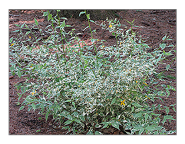
Picta Japanese Kerria

* This is a 'special order' plant - contact store for details