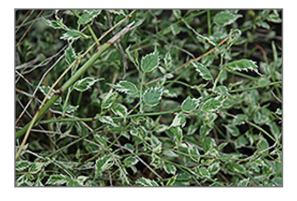
Picta Japanese Kerria foliage