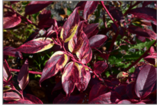
Rainbow Fetterbush in fall

Rainbow Fetterbush makes a fine choice for the outdoor landscape, but it is also well-suited for use in outdoor pots and containers. Because of its height, it is often used as a 'thriller' in the 'spiller-thriller-filler' container combination; plant it near the center of the pot, surrounded by smaller plants and those that spill over the edges. It is even sizeable enough that it can be grown alone in a suitable container. Note that when grown in a container, it may not perform exactly as indicated on the tag - this is to be expected. Also note that when growing plants in outdoor containers and baskets, they may require more frequent waterings than they would in the yard or garden.