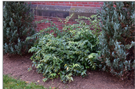
Rainbow Fetterbush