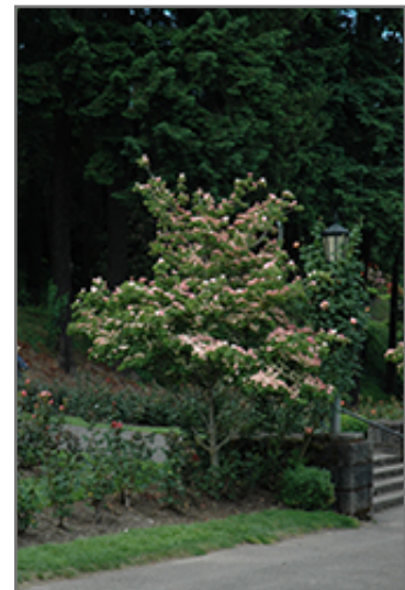
Heart Throb Chinese Dogwood in bloom