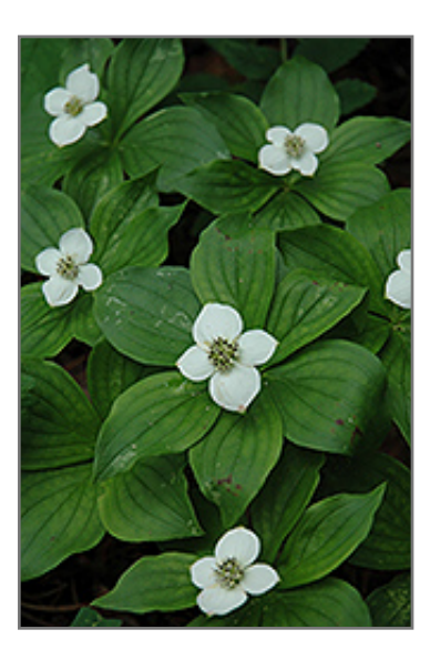
Bunchberry flowers