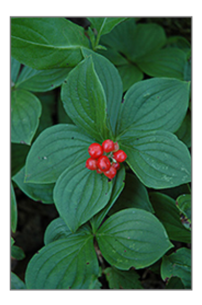
Bunchberry fruit