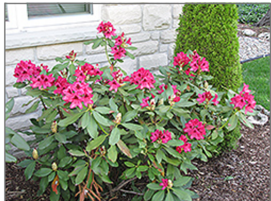
Nova Zembla Rhododendron in bloom