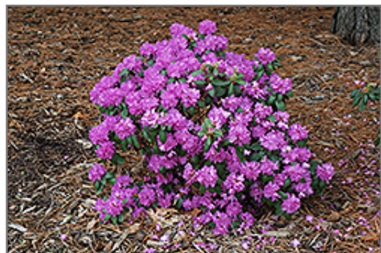
Compact P.J.M. Rhododendron in bloom