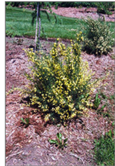
Scotch Broom in bloom