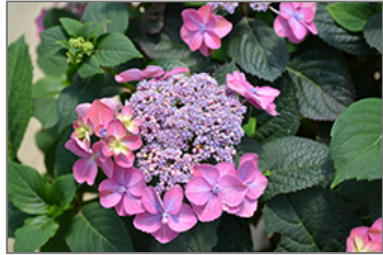
Tuff Stuff Hydrangea flowers

Tuff Stuff Hydrangea makes a fine choice for the outdoor landscape, but it is also well-suited for use in outdoor pots and containers. With its upright habit of growth, it is best suited for use as a 'thriller' in the 'spiller-thriller-filler' container combination; plant it near the center of the pot, surrounded by smaller plants and those that spill over the edges. It is even sizeable enough that it can be grown alone in a suitable container. Note that when grown in a container, it may not perform exactly as indicated on the tag - this is to be expected. Also note that when growing plants in outdoor containers and baskets, they may require more frequent waterings than they would in the yard or garden.